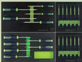
WX2810/SE5 Set of hexagonal screwdrivers