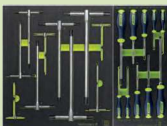
WX2717/SE10 Set of hex. male t-handle wrenches with fixed shaft