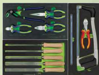
WX3750/SE4 Pliers and nippers