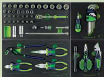
WX2180/SE39 Set of socket wrenches