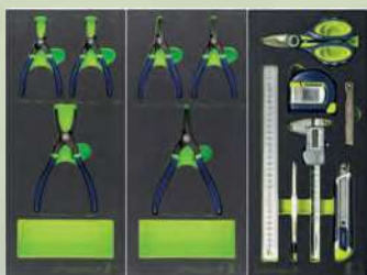
WX3400/SE3 Set of straight nose pliers for internal circlips