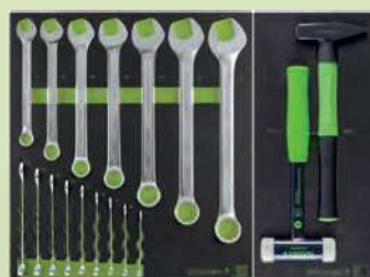
WX1060/SE16 Set of combination wrenches