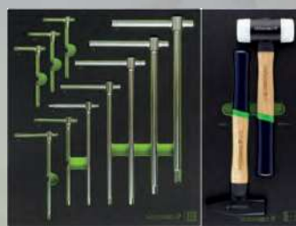
WX2700/SE10 Hexagonal T-wrenches sliding rod