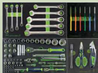
WX1350/SE9 Set of combination wrenches reversible ratchet