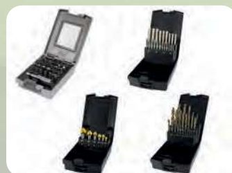
WX4590/31 Set of bits 1/4"