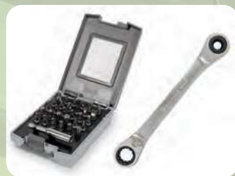
WX4590/31 Set of inserts 1/4"